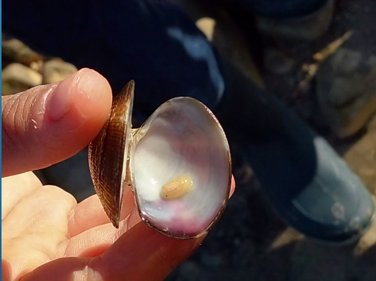
A clam shell and a parasite